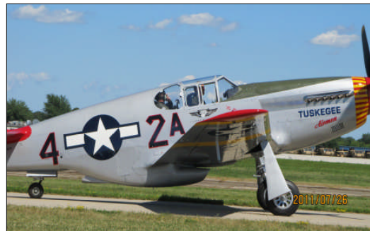
Tuskegee Airman P-51 Mustang

We heard Bob Hoover, 89, (Pictured center) recount the story of his prisoner of war experience in Germany and how he escaped enemy camp. Ole Yeller pictured behind.